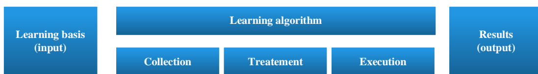
Figure N°1: Simplified Diagram of AI Operation

Emerging in the 1950s, artificial intelligence (AI) is a branch of computer science focused on creating systems capable of performing tasks that typically require human intelligence (Brooks, 1999). Academic research often draws an analogy between AI technology and the human brain to describe its functioning. In our analysis, we will support our discussion with a simplified diagram illustrating how learning algorithms operate, based on the principles of the human brain's functioning: